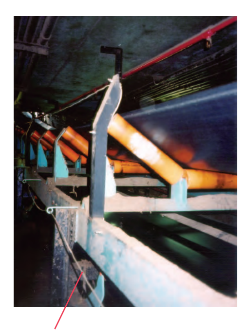
Protectowire Linear Heat Detector

Protectowire Linear Heat Detector is a component of a complete family of fire detection systems manufactured by The Protectowire Company.