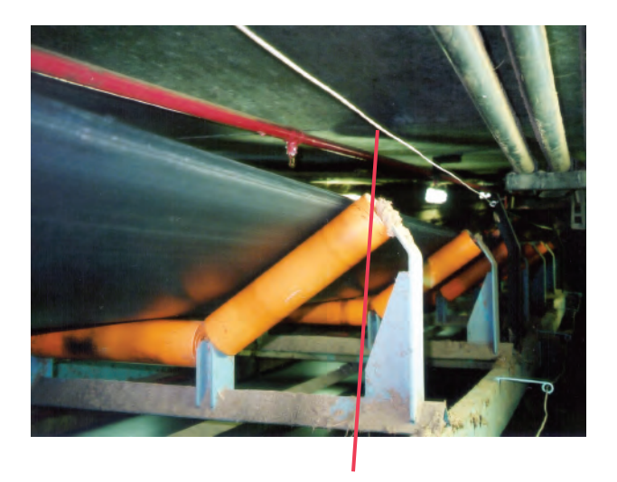
Protectowire Linear Heat Detector

On belt type conveyors, Protectowire Linear Heat Detector can be ceiling or pipe mounted, or installed on either side of the belt on or above the idler arms. Type XCR or EPR Detectors withstand abrasive coal dust, moisture and the corrosive atmosphere found in this environment.