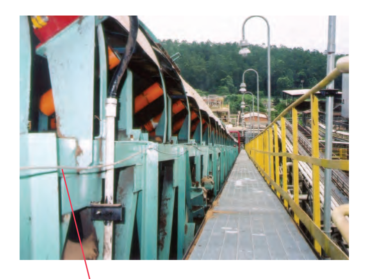
Protectowire Linear Heat Detector