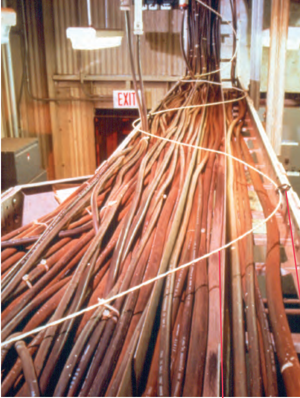
Photo taken at: Bethlehem Steel Corp. Sparrows Point Plant, Sparrows Point, Maryland, U.S.A.