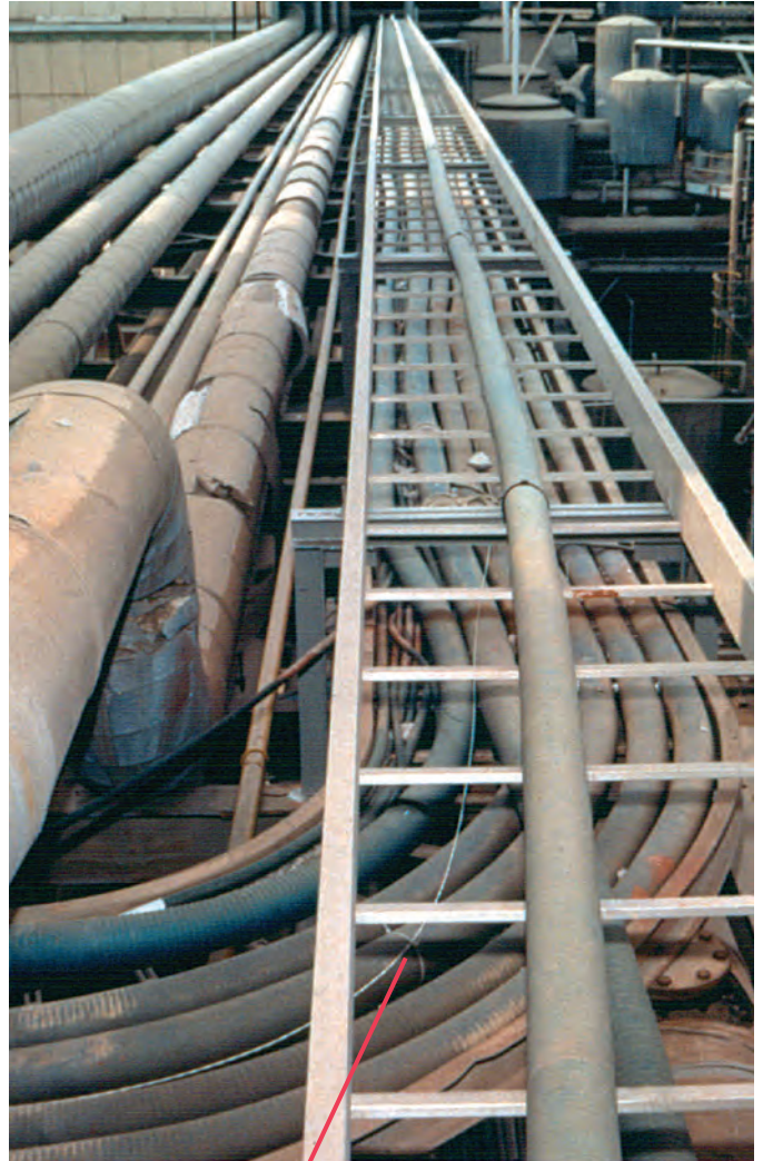
Protectowire Linear Heat Detector

Protectowire Linear Heat Detector is a component of a complete family of fire detection systems manufactured by The Protectowire Company.