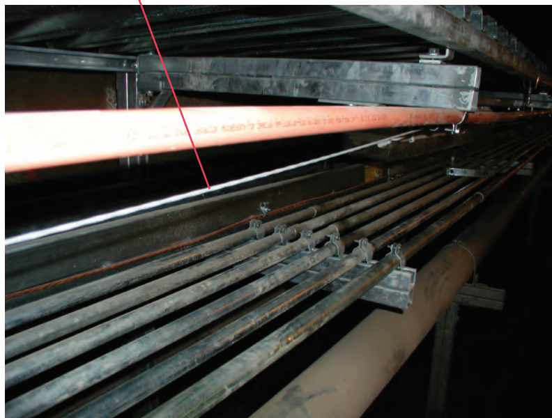
Protectowire Linear Heat Detector