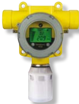
Sensepoint XCD Class I, Division 1