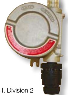
Sensepoint XCD Class I, Division 2 with Remote Sensor