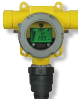
Sensepoint XCD Class I, Division 2